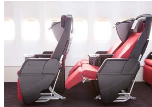
<JAL SKY PREMIUM >