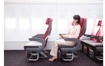
<JAL SKY WIDER>

The new JAL JFK=HND service is in addition to the airline’s daily JFK=Tokyo-Narita (NRT) operation for a total of 14 weekly roundtrips between Tokyo and New York.