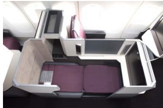
<JAL SKY SUITE>